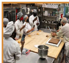
BAKING AND PASTRY ARTS